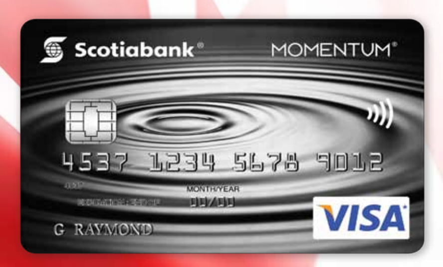
Scotia Momentum® No-Fee VISA* Card

Get up to $5,000 in an unsecured credit card<sup>2</sup> from Scotiabank under the Scotiabank StartRight ® Program<sup>1</sup>